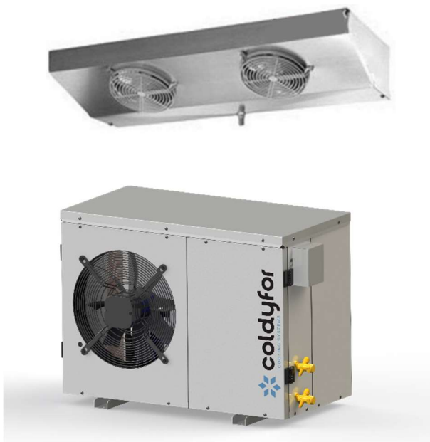
Indicative product Image