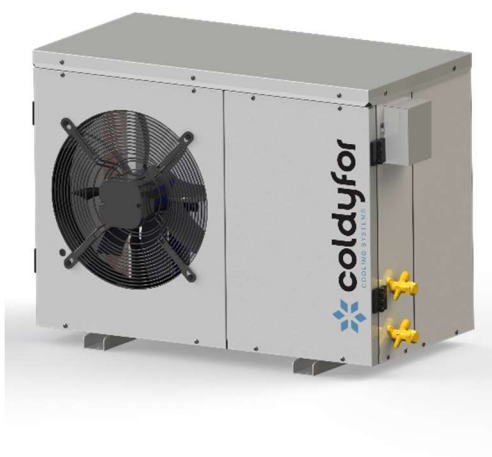
Indicative product image