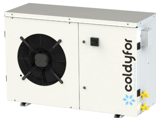
Indicative product image