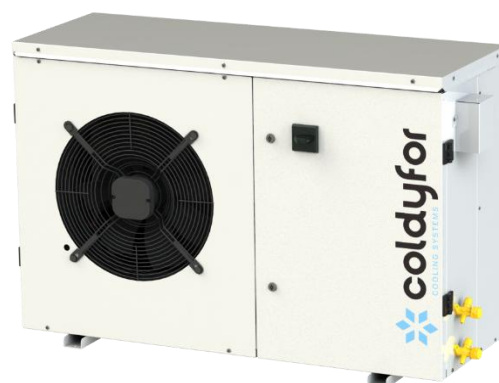
Indicative product image