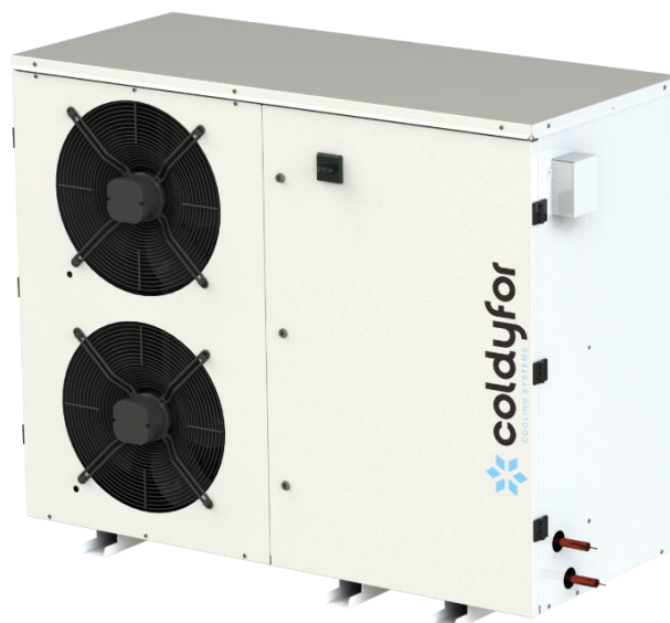
Indicative product image