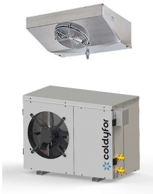
Indicative product Image