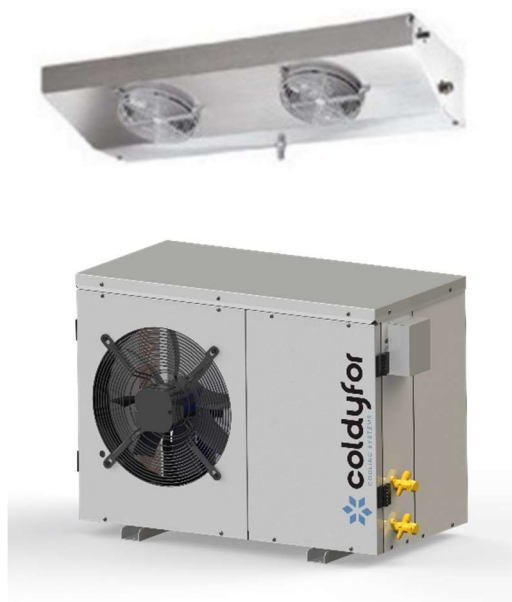
Indicative product Image