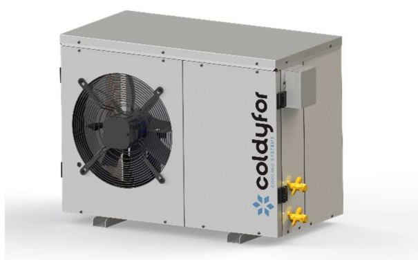
Indicative product image