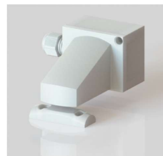
Magnetic door micro-switch