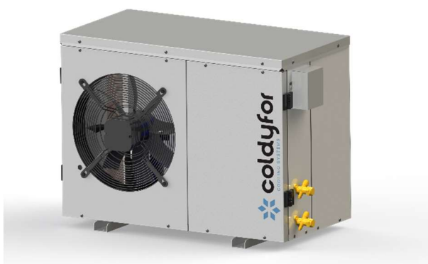
Indicative product Image