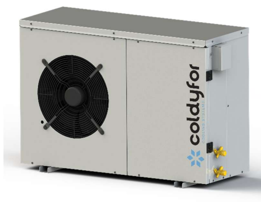
Indicative product Image