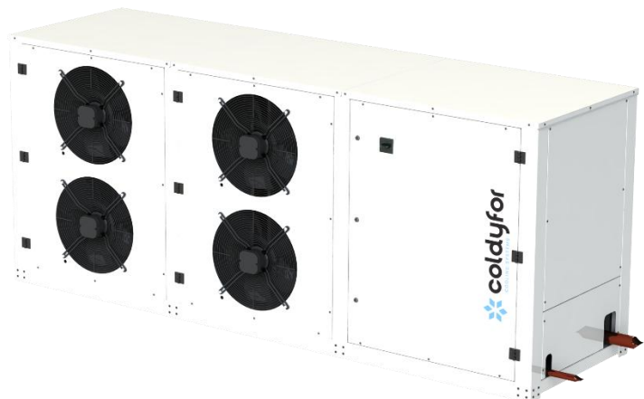
Indicative product image